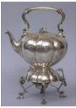
Lot #508: VICTORIAN SILVER-PLATED KETTLE ON WARMING STAND Elkington & Co., Birmingham: the octafoil bowl with swing handle, fluted s-scroll spout, the stand on s-scroll legs ending in shell feet. Estimate: $ 300.00 - $ 500.00