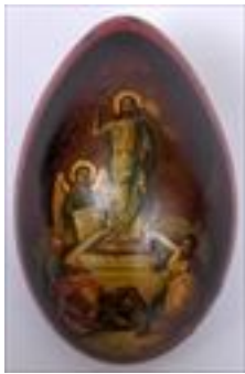
Lot #510: RUSSIAN LACQUER EGG-FORM LIDDED BOX The one side painted with Christ Resurrected, the other a city plaza with tower and onion domes, inscribed on gilt interior; 4 x 6 1/2 x 4 1/8 in. Estimate: $ 300.00 - $ 500.00