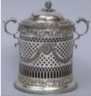
Lot #509: ENGLISH SILVER-PLATED BISCUIT BARREL The pierced and relief-molded cylindrical panel with handles and blue glass liner. Estimate: $ 200.00 - $ 400.00