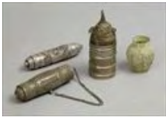
Lot #179: Four Eastern Metalwork Articles Including two scroll holders, a cuff bracelet covered into a container and a censer. Together with a patinated metal pierced jar marked J.N. Taylor, London; scroll holders 6 1/4 to 6 1/2 in. Estimate: $ 25.00 - $ 50.00