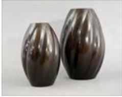
Lot #177: Two Japanese Patinated Metal Graduated Ovoid Vases 10 to 12 in. Estimate: $ 250.00 - $ 500.00