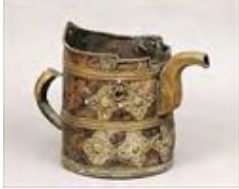
Lot #178: Tibetan Copper and Brass Water Pitcher 11 3/8 in., 8 3/4 in. diam. Provenance: Property from a Long Island Estate. Estimate: $ 100.00 - $ 200.00