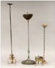
Lot #180: Eastern Brass and Copper Tripod Brazier Together with an incense burner and two candlestands; 7 1/2 in., 6 1/2 in. diam. Estimate: $ 25.00 - $ 75.00