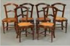
Lot #88: Set of Six German Neo-Renaissance Rosewood Cane Seat Side Chairs 34 5/8 x 18 x 18 in. Estimate: $ 150.00 - $ 250.00