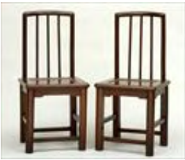
Lot #89: Pair of Chinese Hardwood Side Chairs 40 x 18 1/4 x 16 in. Estimate: $ 100.00 - $ 150.00