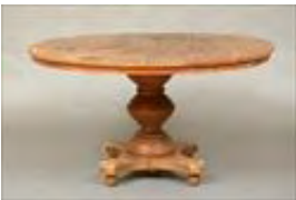
Lot #90: Victorian-Style Oak Tilt-Top Breakfast Table 54 1/4 in. diam. Estimate: $ 200.00 - $ 400.00