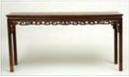
Lot #86: Chinese Long Altar Table 36 1/2 in. x 5 ft. 11 3/4 in. x 17 1/4 in. Estimate: $ 800.00 - $ 1200.00