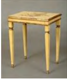
Lot #87: Italian Neoclassical-Style Painted and Decorated Low Table 20 1/8 x 17 x 12 1/2 in. Estimate: $ 40.00 - $ 60.00