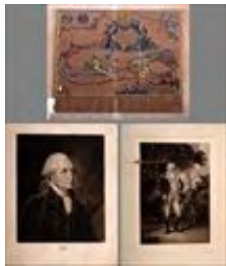
Lot #199: Two Mezzotints and a Hand-Colored Engraved Map Unframed; 15 1/2 x 19 in. (sheet). Provenance: Property from the Collection of Patti Cadby Birch. Estimate: $ 75.00 - $ 125.00