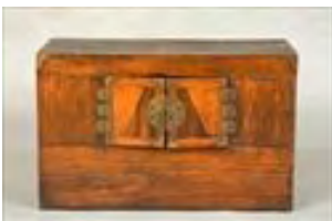
Lot #125: Korean Hardwood Cabinet 20 1/2 x 33 1/4 x 15 1/4 in. Estimate: $ 400.00 - $ 600.00