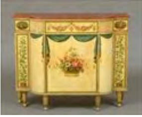
Lot #131: George III-Style Painted and Decorated Commode, in the Manner of George Brookshaw