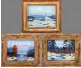
Lot #196: Francis Dixon (American, Early 20th C.): Three landscapes Oil on wood panel, signed lower right, framed; largest 7 1/2 x 9 1/2 in. (sight). Estimate: $ 300.00 - $ 500.00