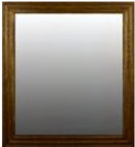
Lot #133: Neoclassical-Style Giltwood Wall Mirror