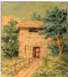
Lot #200: European School: Landscape with House Watercolor on paper, unframed; 7 x 6 in. Estimate: $ 25.00 - $ 50.00