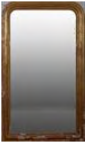
Lot #132: Napoleon III Giltwood Overmantel Mirror