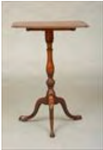
Lot #121: George III-Style Carved Mahogany Tilt-Top Candlestand 28 1/4 x 20 x 15 1/2 in. Estimate: $ 150.00 - $ 250.00