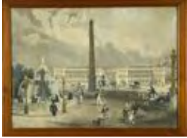
Lot #197: French School (19th C.): Place de la Concorde Hand-colored lithograph, framed. Estimate: $ 100.00 - $ 200.00