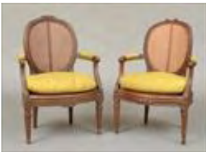
Lot #124: Two Louis XVI-Style Carved Beechwood and Cane Fauteuils Larger 36 x 24 x 22 3/4 in. Estimate: $ 800.00 - $ 1200.00