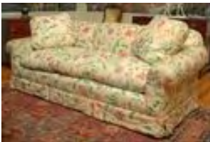
Lot #123: 20th C. Chintz-Upholstered Sofa, Designed by Imogen Taylor of Colefax & Fowler 30 1/2 in. x 6 ft. 6 in. x 34 in. Estimate: $ 500.00 - $ 800.00