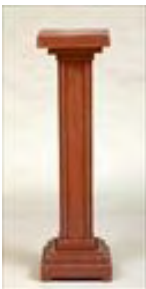
Lot #134: Red-Painted Pedestal