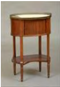
Lot #122: Louis XVI Mahogany Marble-Top Table de Chevet 29 x 19 1/4 x 14 1/2 in. Estimate: $ 700.00 - $ 900.00