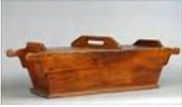
Lot #301: Pine Dough Box 13 1/2 x 40 x 14 1/2 in. Estimate: $ 75.00 - $ 125.00