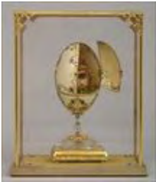
Lot #303: Continental Gilt-Metal Mounted Porcelain Egg on Stand Cased; 7 in. Estimate: $ 300.00 - $ 500.00