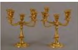
Lot #306: Pair of George II-Style Gilt-Metal Five-Light Candelabra 12 in., 13 in. diam. Estimate: $ 100.00 - $ 200.00