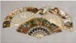
Lot #302: Three Continental Painted Paper Fans with Mother-of-Pearl or Ivory Sticks Largest 10 3/4 x 20 1/4 in. Estimate: $ 200.00 - $ 400.00