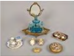
Lot #304: Continental Gilt-Metal Dressing Stand and Mirror with Mary Gregory-Style Glass Scent Bottles, Jar and Tray Together with a porcelain miniature tea service, a Japanese Satsuma covered box, an enamel box, two enamel egg-form boxes and a porcelain miniature part tea service; mirror 10 1/4 x 9 1/2 in. Estimate: $ 300.00 - $ 600.00