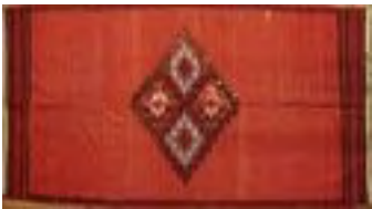
Lot #72: Kilim Rug