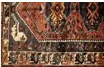
Lot #75: Modern Persian Rose- Ground Rug