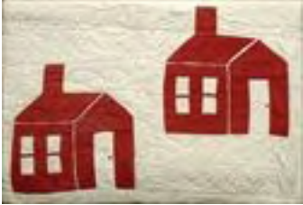
Lot #71: American Cotton Pieced 'School House' Pattern Quilt