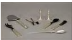
Lot #5: Eight Sterling Silver Articles Including a Georg Jensen part caviar set comprising spreader, fork and spoon; pair of miniature candlesticks; Georg Jensen scissor sugar tongs; Georg Jensen spoon; and an A. Michelsen cheese slice. Candlesticks 2 1/2 in. Estimate: $ 150.00 - $ 250.00