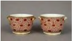
Lot #2: Pair of English Porcelain Cachepots 6 in., 8 in. diam. Estimate: $ 200.00 - $ 400.00