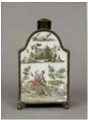
Lot #3: English Decoupage-Decorated Glass and Painted Tole Tea Caddy 7 3/4 x 4 1/4 x 2 3/4 in. Estimate: $ 150.00 - $ 300.00