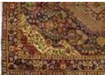
Lot #74: Tabriz Violet-Ground Medallion Carpet