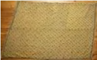
Lot #73: Floral Needlework Rug