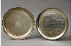
Lot #1: Two American Sterling Silver Presentation Trays One by Lunt, the other by Reed & Barton; 12 to 12 1/4 in., approx. 41 oz. combined weight. Estimate: $ 100.00 - $ 200.00