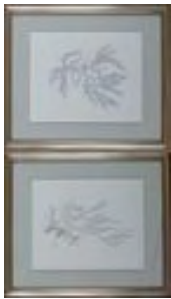
Lot #32: Saicher-Marin Studio: "Solarized Seaweed" Prints, matted and framed; 20 1/2 x 16 1/2 in. (sheet). Estimate: $ 150.00 - $ 250.00