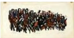
Lot #95: John Ross: "Torah Parade" Woodblock print in color, 1961; 11 3/4 x 22 3/4 in. Estimate: $ 100.00 - $ 200.00