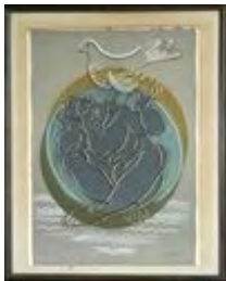
Lot #93: 20th C. School: Man and Dove Lithograph, framed; 25 3/4 x 18 in. (image). Provenance: Property from a Long Island Estate. Estimate: $ 25.00 - $ 50.00