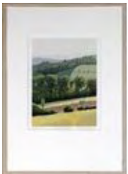
Lot #6: Gretchen Dow Simpson (American, b. 1939): "Waverly, Pennsylvania" Printer's proof, signed lower right, titled lower center, matted and framed; 11 x 8 in. (image). Estimate: $ 100.00 - $ 200.00