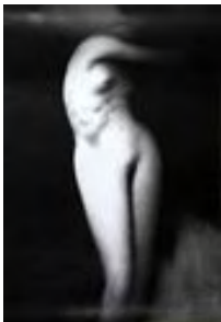
Lot #34: 20th C. School: Female Torso Print, initialed PE lower right, creasing, folds and marring; 47 1/2 x 32 1/2 in. Estimate: $ 50.00 - $ 75.00