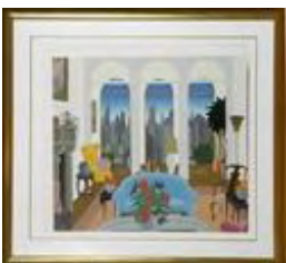
Lot #96: 20th C. School: New York Interior Colored lithograph; 36 x 40 in. (sight). Estimate: $ 50.00 - $ 75.00