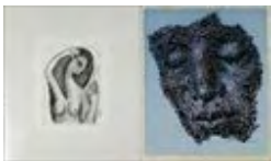
Lot #5: 20th C. School: Five Assorted Prints, Watercolors and Pastel Drawings Largest 25 1/2 x 18 in. (sheet). Provenance: Property from a Long Island Estate. Estimate: $ 100.00 - $ 200.00