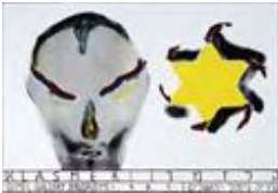
Lot #92: Gabriel Klasmer: Untitled Mixed media print, signed, dated 1982, and numbered lower right; 19 5/8 x 27 1/2 in. (sheet). Estimate: $ 150.00 - $ 250.00