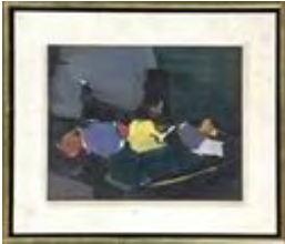
Lot #91: G. Dawidowitsch (Israeli, 20th C.): Abstract Oil on canvas, initialed lower left and dated '67, framed; 8 1/4 x 10 in. (sight). Estimate: $ 100.00 - $ 200.00