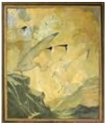
Lot #4: R.F. Valario (20th C.): Seascape with Seagulls Oil on canvas, illegibly signed and dated 1929 lower right, framed; 35 3/4 x 29 3/4 in. (sight). Estimate: $ 100.00 - $ 200.00