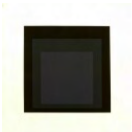
Lot #224A: After Josef Albers: Homage to the Square

Screenprint, unsigned, unframed; 17 x 17 in. (sheet).