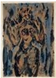
Lot #240: 20th C. School: Female Nude Acrylic on paper, illegibly signed lower right; 28 1/4 x 19 3/4 in. Estimate: $ 50.00 - $ 75.00