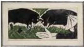
Lot #238: Fumi Komatsu: Bulls Locking Horns Woodblock print, signed lower right, matted and framed; 11 1/4 x 23 1/2 in. (sight). Estimate: $ 25.00 - $ 50.00