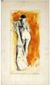
Lot #236: Morton Roberts: Study of Female Nude Crayon and watercolor on paper, signed lower right; 26 x 14 in. (sheet). Estimate: $ 50.00 - $ 75.00