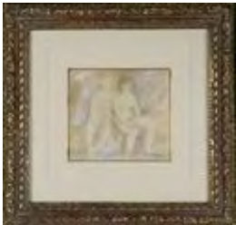
Lot #224: After Jules Pascin: Two Female Figures

Watercolor and ink on paper, signed lower right, framed; 7 1/2 x 8 1/4 in. (sight).