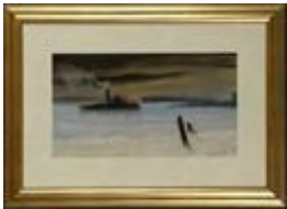
Lot #223: After Joseph Stella: Tugboat at Dusk

Pastel on paper, signed lower right, matted and framed; 12 1/2 x 22 1/4 in. (sight).