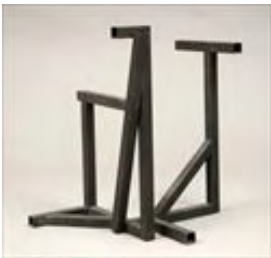
Lot #239: Attributed to Bernard (Tony) Rosenthal (American, 1914-2009): Geometric Sculpture Welded steel, unsigned; 24 3/4 in. Estimate: $ 700.00 - $ 1000.00