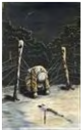
Lot #222: L'Hernault (20th C.): Battlefield

Oil on canvas, signed and dated '40; 39 x 24 in.