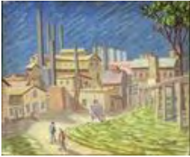
Lot #237: Stewart MacDermott (British, b. 1889): "New York City" Oil on canvas, signed lower right, titled on verso, unframed; 20 x 24 in. (image). Estimate: $ 200.00 - $ 300.00