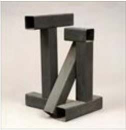
Lot #221: Attributed to Bernard (Tony) Rosenthal (American, 1914-2009): Geometric Sculpture