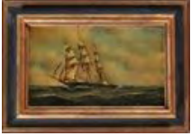
Lot #101: ATTRIBUTED TO ANTONIO JACOBSEN: GOVERNOR GOODWIN Oil on board, 11 3/4 x 19 3/4 in., titled, signed and dated 1915, old label on verso. Estimate: $ 2000.00 - $ 4000.00