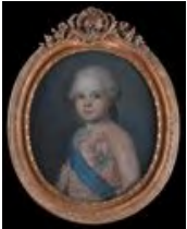
Lot #152: CONTINENTAL SCHOOL: PORTRAIT OF A NOBLE YOUTH Pastel on paper, 20 1/2 x 17 1/2 in. (sight), oval shaped, unsigned. Estimate: $ 800.00 - $ 1200.00