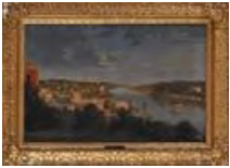
Lot #103: AMERICAN SCHOOL: VIEW OF THE PASSAIC RIVER WITH STEAMBOAT Oil on canvas, 24 x 36 in., unsigned. Estimate: $ 1500.00 - $ 2500.00