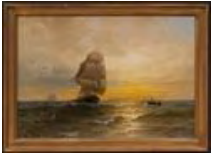
Lot #102: EDWARD MORAN (1829-1901): FULL SAIL AT SUNSET Oil on canvas, relined, 13 1/4 x 18 3/8 in., signed. Provenance: Property of an East Coast Museum. Estimate: $ 3000.00 - $ 5000.00