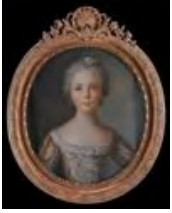
Lot #151: AFTER JEAN-MARC NATTIER: ISABELLE DE BOURBON, INFANTE DE PARME Pastel on oval shaped paper, 20 x 17 in. (image), unsigned. Estimate: $ 800.00 - $ 1200.00