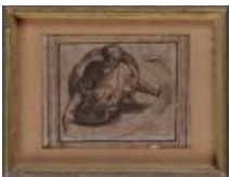
Lot #154: CONTINENTAL SCHOOL: FIGURE STUDY OF BEARDED MAN WITH SCROLL Etching in brown ink (mounted), 5 3/4 x 7 in. (image), unsigned. Estimate: $ 200.00 - $ 400.00