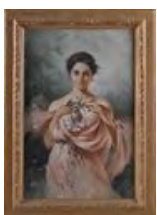
Lot #156: CONTINENTAL SCHOOL: GIRL WITH DOVE Pastel and mixed media on paper, 45 1/2 x 29 1/2 in., signed A.F. Troni. Estimate: $ 700.00 - $ 900.00