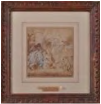
Lot #153: ITALIAN SCHOOL: MOTHER WITH CHILD Mixed media drawing, 8 1/4 x 7 3/4 in., unsigned; previously attributed to Benedetto Castiglione. Estimate: $ 1000.00 - $ 2000.00