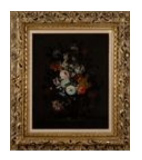
Lot #333: MANNER OF PETER HARDIME: FLORAL STILL LIFE

Oil on canvas, relined, 31 1/2 x 25 1/2 in., unsigned.