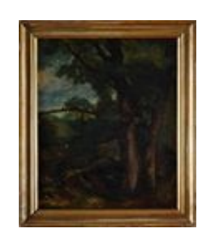
Lot #309: EUROPEAN SCHOOL: LANDSCAPE WITH TREE

Oil on canvas, 24 \times 19 \times 1/2 in., signed lower