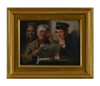
Lot #301: EUROPEAN SCHOOL: CATCHING UP ON THE NEWS

Oil on academy board, 9 3/4 x 13 in., with incised signature lower right: E. Durand.