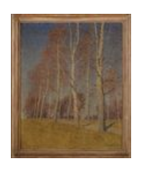
Lot #320: RUSSIAN SCHOOL: BIRCH TREES

Oil on canvas, 36 1/4 x 25 1/2 in., signed in cyrillic and inscribed on verso.