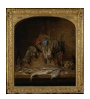
Lot #334: EUROPEAN SCHOOL: NATURE MORTE

Oil on canvas, relined, 46 1/4 x 41 in. (sight), unsigned.