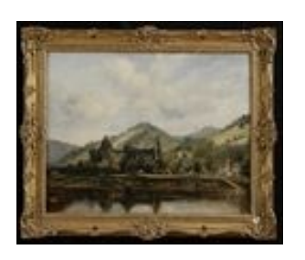
Lot #314: EUROPEAN SCHOOL: CATHEDRAL IN THE HILLS

Oil on canvas, relined, 25 3/4 \times 32 1/4 in.