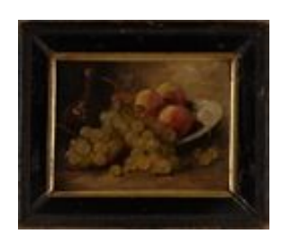
Lot #336: EUROPEAN SCHOOL: STILL LIFE WITH FRUIT, BOTTLE AND PLATE

Oil on panel, 6 1/8 x 8 3/8 in., signed Lebrun [?].