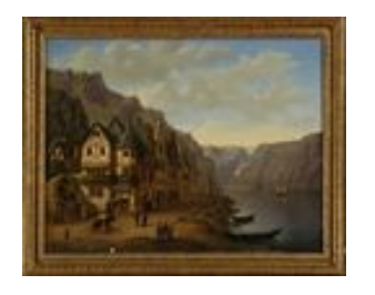
Lot #319: EUROPEAN SCHOOL: TOWNS ON THE RIVER

Oil on canvas, relined, 27 3/4 x 35 3/4 in., unsigned.