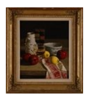
Lot #337: TABLETOP STILL LIFE

Oil on panel, 15 1/4 x 13 in., signed indistinctly