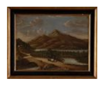
Lot #306: AMERICAN SCHOOL: COUNTRY LIFE

Oil on canvas, 13 x 17 1/4 in., unsigned.