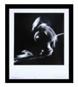
Lot #554: JOSEP BATLLE (b. 1958): "HELIX ASPERSA II"

Photograph, 15 7/8 \times 14 1/8 in. (sheet), signed, titled, dated 1988 and numbered P/A in the margin.