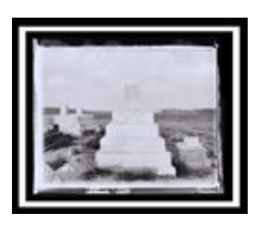
Lot #531: SUSAN HARBAGE PAGE (20TH/21ST C.): THE MYTH OF OWNERSHIP, 1996

Sepia tone photograph, 19 7/8 x 23 7/8 in. (sheet), signed, numbered 2/25 and inscribed Negev Desert, printed 2000.