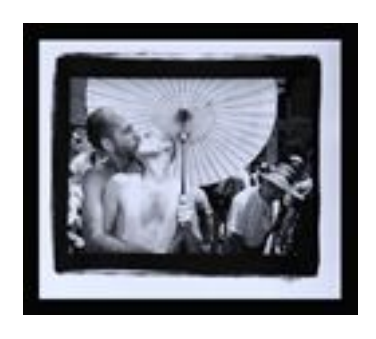
Lot #516: LISA CRUMB (20TH/21ST C.): GAY PRIDE, NY

Photographs, 14 \times 10 in. (sheet), 2 are signed and dated 1994 lower right and all 3 are stamped, titled and numbered 1/15.