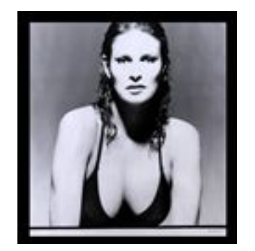
Lot #518: VICTOR S. KREBNESKI (b. 1929): RAQUEL WELCH

Photograph, 46 x 46 in., signed and dated lower right.