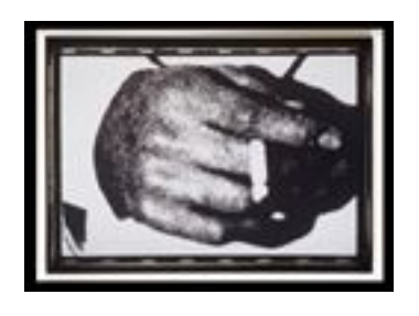
Lot #521: RICHARD PRINCE (b. 1949): HAND AND CIGARETTE

Ektacolor photo contact enlargement (uncropped), 7 1/4 x 9 3/4 in., inscribed on verso: Happy B/Richard 1980.