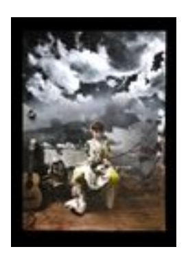
Lot #526: JAN SAUDEK (b. 1935): YOUNG GIRL

Photograph with hand-coloring, 15\ 3/4\ x\ 11\ 7/8 in., signed and numbered 28/50, printed 1983.