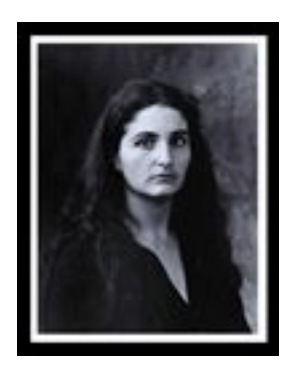
Lot #551: RAFAEL VARGAS (b. 1959): "CANCA"

Photograph, 19\ 11/16\ x\ 15\ 3/4 in. (sheet), signed, titled and dated 1987 on verso.