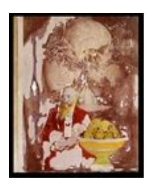
Lot #541: MIGUEL ANGEL YANEZ POLO (b. 1940): "ZEIT UND SEIN, RETRATO DE BRAHMS"

Mixed media, 23 \ 13/16 \ x \ 19 \ 13/16 in. (sheet), titled lower left edge, signed lower left and with artist's blind stamp lower right. Estimate: $200.00 - $300.00