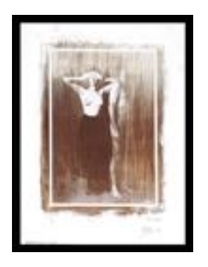
Lot #549: RODRIGO MOSQUERA MARTINEZ (b. 1962): "DOS AMIGOS"

Mixed media on paper, 13 x 10 5/16 in. (sheet), signed, titled, dated '89