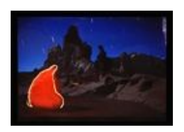
Lot #546: NESTOR TORRENS (b. 1954): UNTITLED

Cibachrome, 14 1/4 x 19 15/16 in. (sheet), inscribed illegibly lower left.