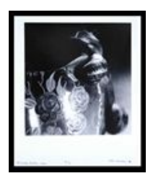
Lot #555: JOSEP BATLLE (b. 1958): "BOMBIX MORI IV"

Photograph, 15 7/8 \times 14 1/8 in. (sheet), signed, titled, dated 1988 and numbered P/A in the margin.