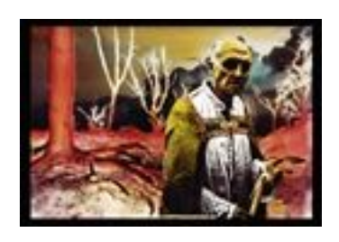
Lot #545: JORGE RUEDA (b. 1943): CURBOSQ

Photograph, 7 5/8 x 10 7/8 in., signed and dated 1974 on verso.