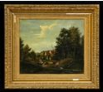
Lot #68: AMERICAN SCHOOL: PASTORAL SCENE WITH FIGURES Oil on panel, 18 1/2 x 21 1/2 in., signed T. Cole and dated 1860. Estimate: $ 200.00 - $ 300.00 Sold at $850