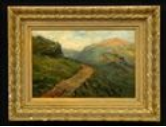
Lot #66: MARIA A'BECKET (d. 1904): MOUNTAIN TRAIL IN SPRING Oil on board, 12 x 18 in., signed lower left. From The Thomas Van Loan Collection. Estimate: $ 500.00 - $ 700.00 Sold at $800