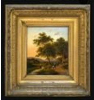
Lot #67: FRENCH SCHOOL: OUTSIDE THE VILLAGE Oil on panel, 12 3/4 x 10 3/4 in., signed J.C. Moreth lower right. From The Thomas Van Loan Collection. Estimate: $ 1200.00 - $ 1800.00 Sold at $4000