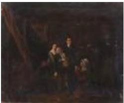
Lot #395: ENGLISH SCHOOL: BENJAMIN WEST'S FINAL MOMENTS Oil on canvas, 25 1/4 x 30 1/2 in. Provenance: Property of the Chrysler Museum of Art, Norfolk, Virginia, proceeds to benefit the Acquisitions Fund. Estimate: $ 200.00 - $ 400.00