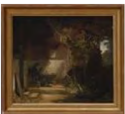
Lot #396: EUROPEAN SCHOOL: MONK READING AMONGST RUINS WITH TWO RABBITS 16 3/4 x 19 in. Estimate: $ 300.00 - $ 500.00