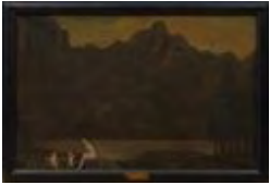
Lot #393: ARTHUR BOWEN DAVIES (1862-1928): LEDA AND THE DIOSCURI Oil on canvas, signed lower left, 26 x 40 in. Provenance: Property Sold by the Art Institute of Chicago. Estimate: $ 6000.00 - $ 8000.00