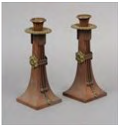
Lot #334: Pair of Arts and Crafts Copper and Brass Candlesticks 9 1/4 x 3 1/8 x 3 1/8 in. Estimate: $ 100.00 - $ 200.00