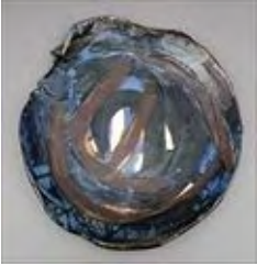
Lot #331: Studio Pottery Shallow Bowl Underside inscribed #1/1990; 2 5/8 x 17 in. Estimate: $ 100.00 - $ 200.00