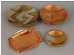
Lot #336: American Arts and Crafts Copper and Silver Dresser Tray, Possibly Joseph Heinrich Together with three Mexican mixed metal bowls; dresser tray 10 1/2 x 8 1/2 in. Estimate: $ 400.00 - $ 600.00