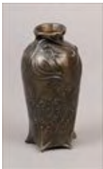
Lot #335: Art Nouveau Bronze Vase 5 1/2 in. Estimate: $ 200.00 - $ 400.00