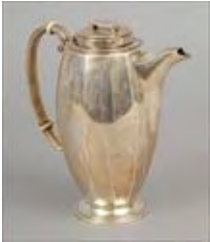
Lot #333: American Art Deco Sterling Silver Coffee Pot, Lunt Silversmiths Signed Robert E. Locerer; 7 1/4 in., approx. 16 oz. Provenance: The Collection of Patti Cadby Birch. Estimate: $ 100.00 - $ 200.00