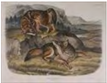
Lot #424: AFTER JOHN JAMES AUDUBON: PRAIRIE WOLF Hand-colored lithograph, 21 3/16 x 27 1/8 in. Estimate: $ 2000.00 - $ 3000.00