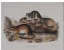
Lot #426: AFTER JOHN JAMES AUDUBON: FLORIDA RAT & ROCKY MTN. NEOTOMA Hand-colored lithographs, 27 x 21 in. (sheet) or 21 x 27 in. (sheet), unframed. Estimate: $ 600.00 - $ 800.00