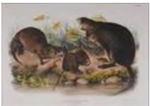
Lot #425: AFTER JOHN JAMES AUDUBON: MUSKRAT, MUSQUASH Hand-colored lithograph, 19 1/16 x 26 in. (sheet). Estimate: $ 500.00 - $ 700.00