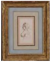
Lot #421: ATTRIBUTED TO GEORGE ROMNEY: PORTRAIT BUST OF A LADY Ink and wash on paper, 4 1/8 x 2 1/8 in. (sheet, sight), 10 x 8 x 1 1/16 in. (frame), unsigned Estimate: $ 250.00 - $ 350.00