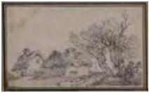
Lot #439: ENGLISH SCHOOL: THATCHED COTTAGE Lithograph on paper, 3 7/16 x 5 11/16 in., 9 1/16 x 11 15/32 x 7/16 in. (frame), unsigned. Estimate: $ 150.00 - $ 200.00