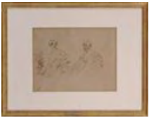
Lot #422: AFTER THOMAS SULLY: PORTRAIT STUDY Ink on tinted paper, 8 1/2 x 11 in. (image, sight), 15 1/8 x 19 1/8 x 3/4 in. (frame). Estimate: $ 300.00 - $ 500.00