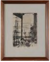
Lot #437: AFTER JAMES ABBOTT MCNEILL WHISTLER: ROTHERHITHE Reproduction print, 10 11/16 x 7 3/4 in. (image, sight), 18 5/8 x 15 1/4 x 1 in. (framed). Estimate: $ 30.00 - $ 50.00