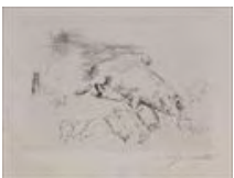
Lot #427: LOVIS CORINTH (1858-1925): SOW AND PIGLETS Etching, 8 3/4 x 11 13/16 (sheet), signed below image lower right; together with an etching of pig studies, 8 1/2 x 9 7/8 in. (sheet), signed below image lower right. Estimate: $ 300.00 - $ 500.00