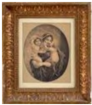
Lot #423: ALINE REGNAULT (19TH C.): MARY WITH THE INFANTS JESUS AND ST. JOHN THE BAPTIST Mezzotint, signed and dated 1833 lower left, matted and framed; 7 3/4 x 6 in. (image). Estimate: $ 100.00 - $ 200.00