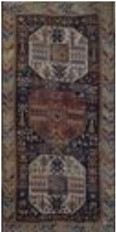
Lot #186: Caucasian Long Rug Approx. 4 ft. 1 in. x 8 ft. 1 1/2 in. Estimate: $ 400.00 - $ 600.00