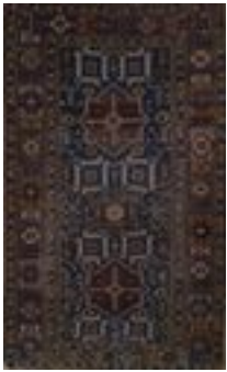
Lot #184: Caucasian Rug Approx. 3 ft. 11 in. x 6 ft. 6 in. Estimate: $ 300.00 - $ 500.00