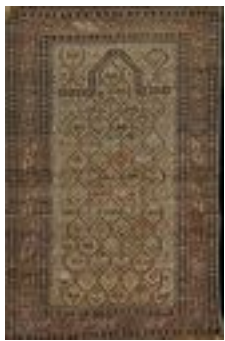
Lot #182: Caucasian Prayer Rug Approx. 4 ft. 9 in. x 3 ft. 4 in. Estimate: $ 300.00 - $ 400.00