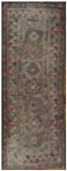
Lot #185: Caucasian Long Rug Approx. 8 ft. 7 in. x 3 ft. 7 1/2 in. Estimate: $ 300.00 - $ 400.00