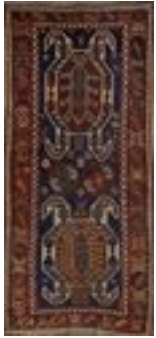
Lot #187: Caucasian Long Rug Approx. 4 ft. x 8 ft. Estimate: $ 500.00 - $ 700.00