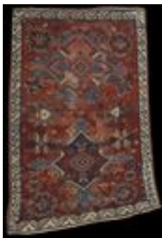
Lot #183: Seychour Rug Approx. 4 ft. 8 in. x 3 ft. 3 in. Estimate: $ 250.00 - $ 350.00