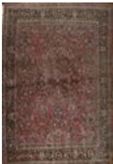
Lot #190: Sarouk Carpet Approx. 11 ft. 11 in. x 8 ft. 11 1/2 in. Estimate: $ 600.00 - $ 800.00