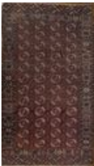
Lot #189: Tekke Carpet Approx. 10 ft. 1 in. x 6 ft. 11 1/2 in. Estimate: $ 600.00 - $ 1000.00