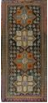
Lot #181: Turkish Kilim Approx. 9 ft. 9 1/2 in. x 4 ft. 9 1/2 in. Estimate: $ 100.00 - $ 200.00