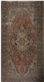
Lot #188: Heriz Carpet Approx. 12 ft. 2 in. x 8 ft. 1/2 in. Estimate: $ 500.00 - $ 800.00