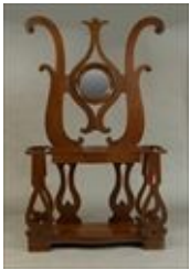
Lot #322: Late Classical Mahogany Hall Stand