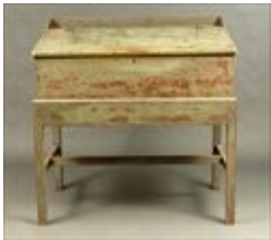
Lot #303: 19th C. Blue-Painted Pine Plantation Desk on Later Stand