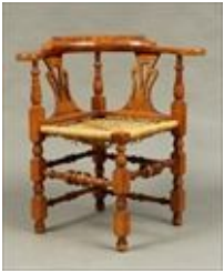
Lot #321: New England Queen Anne-Style Maple Rush-Seat Corner Chair