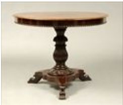
Lot #323: American Classical-Style Carved Mahogany Center Table