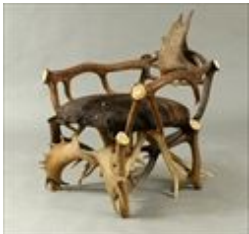
Lot #305: Antler and Hide Armchair