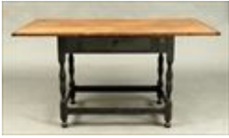
Lot #311: Colonial-Style Green-Painted and Maple Tavern Table, Toad Hall, Cooperstown, NY