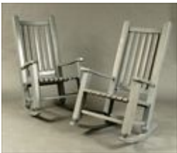
Lot #313: Four American Gray-Painted Porch Rocking Chairs