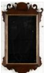
Lot #306: Chippendale-Style Mahogany and Parcel-Gilt Wall Mirror