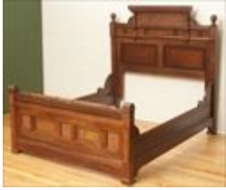
Lot #301: American Aesthetic Movement Part-Ebonized Walnut and Marquetry Bedstead