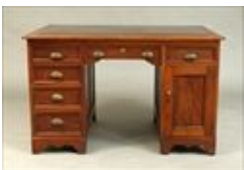
Lot #325: American Victorian Walnut and Figured Walnut Pedestal Desk