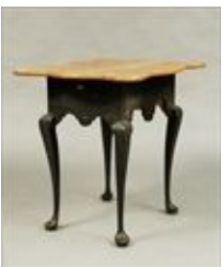
Lot #326: New England Queen Anne-Style Green-Painted and Maple Porringer-Top Tea Table, Toad Hall, Cooperstown, NY

Pen inscription on underside of drawer, "By Dan Pos.... for Toad Hall, Cooperstown, NY"; 26 3/4 x 27 x 23 in.