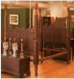
Lot #312: Gothic Revival Mahogany and Maple Bedstead