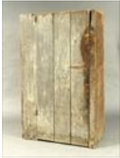
Lot #331: American Blue-Painted Cupboard, 19th C.