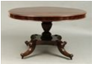
Lot #332: Classical Mahogany Tilt-Top Breakfast Table