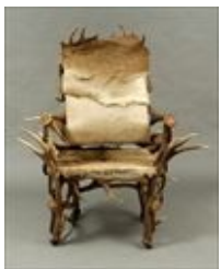
Lot #324: Antler and Hide Armchair