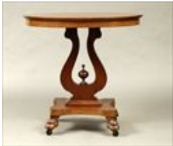
Lot #304: American Classical-Style Mahogany Lyre-Base Oval Center Table