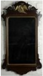
Lot #314: Chippendale Mahogany and Parcel-Gilt Wall Mirror