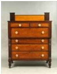
Lot #315: Classical Carved Figured Maple and Cherry Chest of Drawers