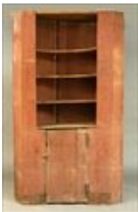
Lot #334: American Salmon-Painted Pine Corner Cupboard, 19th C.