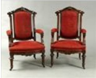
Lot #333: Pair of American Renaissance Revival Carved Rosewood Armchairs