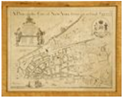
Lot #409: After James Lyne: "A Plan of the City of New York from an actual Survey" Reproduction map, framed; 18 1/4 x 23 1/4 in. (sight). Estimate: $ 50.00 - $ 100.00