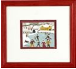
Lot #407: R. Hurkamp (American, 20th C.): Winter Village Gouache on paper, signed lower left, matted and framed; 3 1/4 x 4 1/4 in. (sheet). Estimate: $ 50.00 - $ 100.00