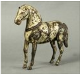
Lot #487: Painted Sheet-Metal Mechanical Horse-Form Toy 11 x 11 3/4 in. Estimate: $ 200.00 - $ 250.00