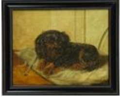
Lot #408: S. Lee (20th C.): Portrait of a Dog Oil on canvas, signed lower right, framed; 16 x 20 in. Estimate: $ 100.00 - $ 150.00