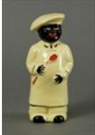
Lot #488: Ceramic Salt Shaker 7 1/2 in. Estimate: $ 50.00 - $ 75.00