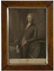
Lot #410: English School (18th C.): The Right Honorable William Pitt Engraving, framed; 18 1/2 x 12 3/4 in. (sight). Estimate: $ 75.00 - $ 125.00