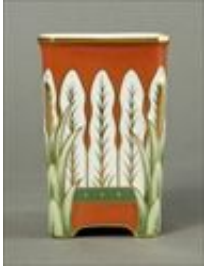
Lot #491: French Porcelain 'Egyptian' Vase, Retailed by Tiffany & Co.