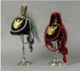
Lot #492: Two American Artillery Shakos, Ridabock & Co., New York

Labeled, black felt with brass badges and plumes; 11 x 10 1/2 in. and 11 3/4 x 11 in.