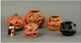
Lot #486: Five American Papier-Mâché Jack O' Lanterns Together with a Halloween witch-form candle; largest jack o' lantern 7 1/4 x 8 3/4 in. Estimate: $ 150.00 - $ 250.00