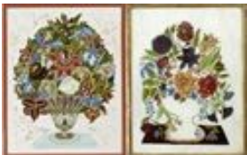
Lot #490: Two Reverse-Painted Glass and Foil Pictures 15 3/4 x 11 3/4 in. and 17 3/4 x 13 3/4 in. Estimate: $ 75.00 - $ 125.00