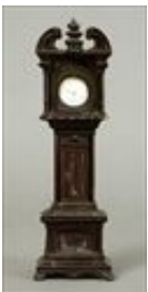
Lot #495: George III-Style Carved Hardwood Longcase Clock-Form Pocket Watch Holder