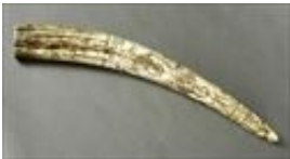
Lot #494: Scrimshaw-Style Engraved Faux Whale Bone