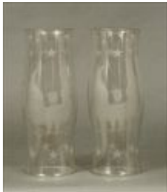
Lot #489: Pair of Etched Glass Hurricane Shades, Modern 15 in., 6 in. diam. Estimate: $ 75.00 - $ 125.00