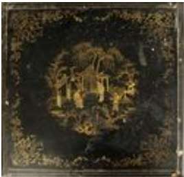
Lot #493: Chinese Export Black Lacquer Box