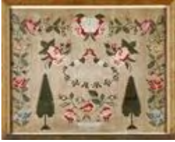
Lot #117: Needlework Picture Framed; 16 x 20 1/2 in. (sight). Estimate: $ 100.00 - $ 200.00