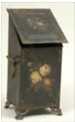
Lot #126: Victorian Tôle-Peinte Coal Scuttle 23 1/2 x 11 x 8 3/4 in. Estimate: $ 50.00 - $ 100.00