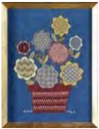
Lot #119: Needlework Picture with Pot of Flowers Framed; 14 1/2 x 10 3/4 in. (sight). Estimate: $ 10.00 - $ 20.00