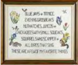
Lot #118: Needlework Picture Framed; 17 x 21 in. (sight). Estimate: $ 25.00 - $ 50.00