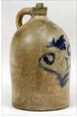
Lot #147: Stoneware Cobalt Decorated Jug, Mounted as a Lamp Jug 16 in. (19 1/2 in. overall), 9 1/2 in. diam. Estimate: $ 100.00 - $ 200.00