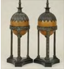
Lot #148: Pair of Faux Ostrich Egg and Metal Lamps 28 x 8 x 8 in. Estimate: $ 40.00 - $ 80.00