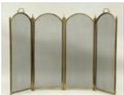
Lot #127: Brass and Wire Mesh Four-Panel Fireplace Screen 34 1/2 x 52 in. Estimate: $ 40.00 - $ 60.00