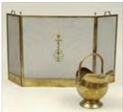
Lot #125: Neoclassical-Style Brass and Wire Mesh Three- Panel Fireplace Screen and a Brass Helmet-Form Coal Scuttle Scuttle 29 1/2 x 29 1/2 in. and firescreen 13 x 10 x 17 in. Estimate: $ 40.00 - $ 80.00