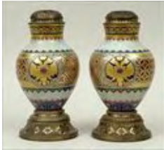
Lot #149: Pair of Russian-Style Gilt and Polychrome Decorated Porcelain Vases, Mounted as Lamps Vases 10 3/8 in. (20 5/8 in. overall). Estimate: $ 100.00 - $ 200.00