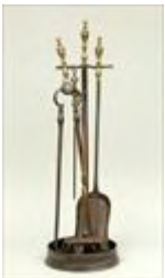
Lot #120: Set of Four Brass and Iron Fireplace Tools with Stand Stand 29 3/4 in., 9 1/2 in. diam. Provenance: From the Collection of the Wanamaker-de Heeren Family. Estimate: $ 600.00 - $ 800.00