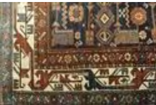
Lot #373: Kurd Bidjar Carpet 11 ft. 6 in. x 3 ft. 7 in. Estimate: $ 800.00 - $ 1200.00