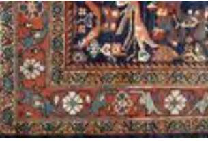
Lot #372: Mahal Carpet 9 ft. 10 in. x 4 ft. 2 in. Estimate: $ 400.00 - $ 600.00