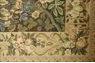
Lot #371: Needlework Rug 8 ft. 10 in. x 5 ft. 11 in. Estimate: $ 200.00 - $ 400.00