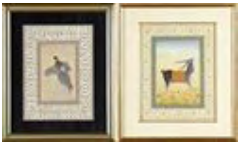
Lot #325: Indian School (20th C.): Pheasant and Impala Watercolor on paper, signed Sneh lower right, framed; 9 to 11 x 8 1/2 to 12 1/2 in. (sight). Estimate: $ 30.00 - $ 50.00