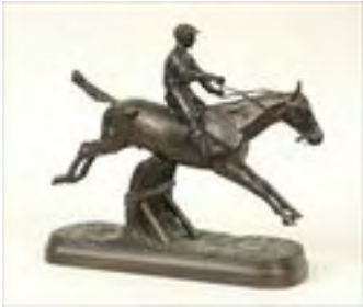
Lot #341: 20th C. School: Leaping Horse with Jockey Bronze; 13 x 4 3/4 x 13 in. Estimate: $ 150.00 - $ 250.00