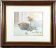
Lot #321: After Rudy de Reynd: Still Life with Walnuts Reproduction print, matted and framed; 15 x 18 in. (sight). Estimate: $ 40.00 - $ 60.00