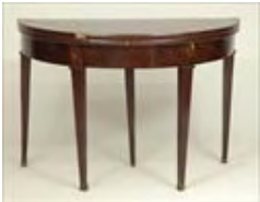
Lot #400: George III Mahogany Demilune Fold-Top Games Table 28 3/4 x 42 x 20 1/2 in. (41 in. open). Estimate: $ 400.00 - $ 800.00