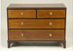
Lot #397: George III-Style Inlaid Mahogany Chest of Drawers Comprised of antique and later parts; 30 x 42 x 18 3/4 in. Estimate: $ 600.00 - $ 800.00