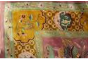
Lot #374: Chinese Art Deco Carpet 12 ft. x 9 ft. Estimate: $ 200.00 - $ 300.00