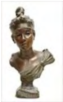
Lot #342: After Emmanuel Villanis: "Phryne" Patinated metal; 25 x 13 1/2 in. Estimate: $ 300.00 - $ 500.00