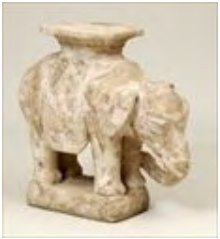
Lot #399: Pottery Elephant-Form Table 21 1/2 x 23 3/4 in. Estimate: $ 100.00 - $ 200.00