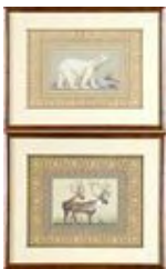
Lot #326: Indian School (20th C.): Caribou and Polar Bear Watercolor on paper, signed Sneh lower right, framed; 8 1/2 to 9 1/4 x 12 to 13 in. (sight). Estimate: $ 50.00 - $ 75.00