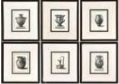
Lot #322: Six Italian Engravings of Antiquities Matted and framed; 7 x 8 1/2 in. (sight). Estimate: $ 500.00 - $ 700.00