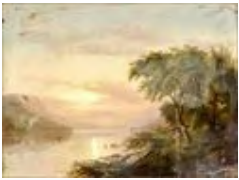
Lot #324: Continental School (19th C.): Landscape with Figure Oil on canvas, unsigned, unframed; 29 3/4 x 40 in. (sight). Estimate: $ 75.00 - $ 150.00