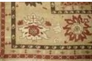
Lot #374A: Woven Wool Rug 17 ft. 5 in. x 12 ft. 8 in. Estimate: $ 700.00 - $ 900.00