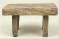
Lot #398: Rustic Stool 14 x 24 3/4 x 15 3/4 in. Estimate: $ 75.00 - $ 125.00