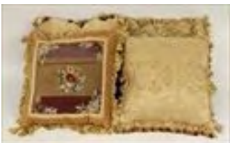
Lot #344: Four Assorted Needlework, Lampas and Brocatelle Pillows Largest 17 x 17 in. Estimate: $ 200.00 - $ 400.00