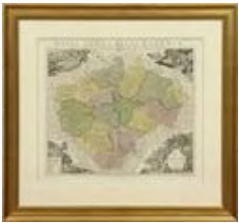
Lot #323: Muller, Johann. "Mappa Totius Regni Bohemiae" Hand-colored engraved map, matted and framed; 20 1/4 x 23 in. (sight). Estimate: $ 50.00 - $ 75.00