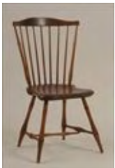
Lot #485: American Windsor Comb-Back Side Chair