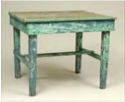
Lot #482: American Painted Pine Side Table