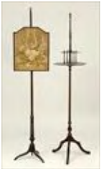
Lot #483: George III-Style Mahogany Firescreen with Needlework Panel and a Victorian Mahogany Two-Tier Flower Stand