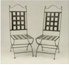
Lot #481: Pair of Renaissance-Style Wrought-Iron and Brass Side Chairs with Curule Bases