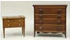
Lot #484: Federal-Style Mahogany Miniature Chest of Drawers

Together with a miniature poudreuse; chest of drawers 11 1/4 x 11 1/4 x 8 in. Provenance: From a Collection of a French Gentleman.