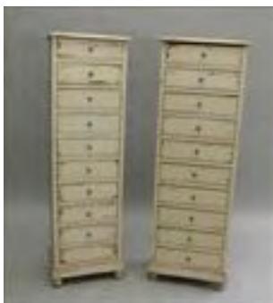
Lot #497: Pair of Green and Pink Painted Tall Chests of Drawers, Modern Estimate: $ 200.00 - $ 400.00