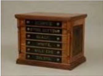
Lot #481: Eastlake Stained Wood Spool Cabinet by Clark