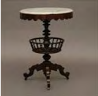
Lot #421: Victorian Sewing Table