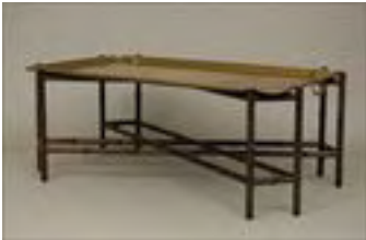
Lot #412A: Tray Top Coffee Table Estimate: $ 300.00 - $ 500.00