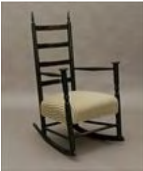
Lot #465: Black-Painted Rocking Chair Estimate: $ 100.00 - $ 200.00