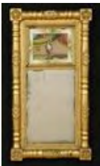
Lot #493: Continental Painted Mirror