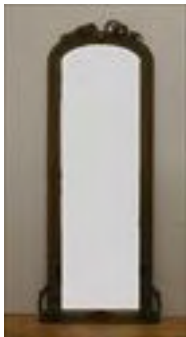
Lot #443: Large Victorian Giltwood Pier Mirror