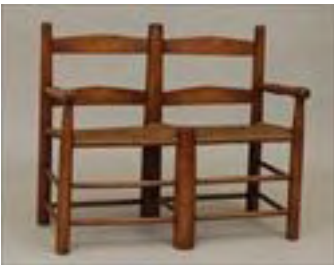
Lot #472: American Figured Maple Wagon Bench