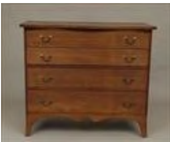
Lot #466: American Inlaid Chest of Drawers 24 1/4 x 18 3/4 in., 27 3/4 x 23 5/8 in., and 22 7/8 x 17 3/4 in. Estimate: $ 150.00 - $ 350.00