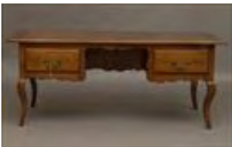
Lot #413: Louis XV-Style French Provincial Bureau Plat Estimate: $ 800.00 - $ 1200.00