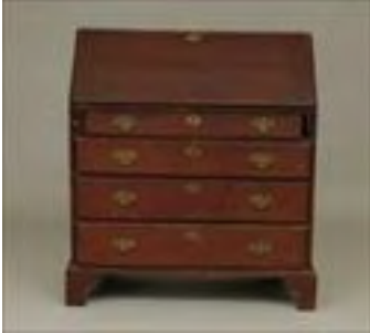
Lot #491: American Painted Four-Drawer Slant-Front Desk