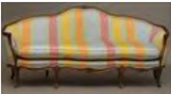
Lot #403: Continental Rococo-Style Settee