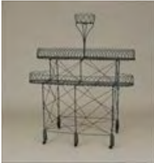
Lot #461: Wirework Two-Tier Garden Stand Estimate: $ 150.00 - $ 250.00