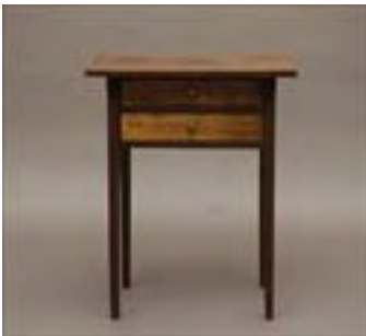
Lot #463: Federal Walnut Night Stand Estimate: $ 200.00 - $ 400.00