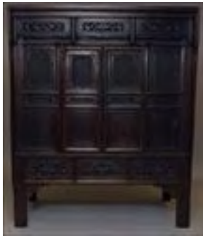
Lot #412: Chinese Carved and Painted Hardwood Cabinet Estimate: $ 400.00 - $ 800.00