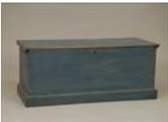
Lot #462: American Blue-Painted Blanket Chest Estimate: $ 200.00 - $ 400.00