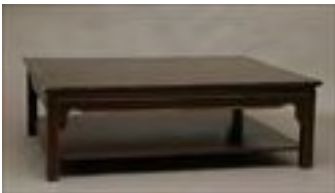
Lot #404: Modern Chinese Coffee Table