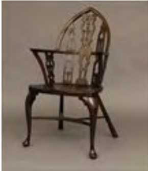
Lot #441: Gothic Windsor Chair, 20th Century