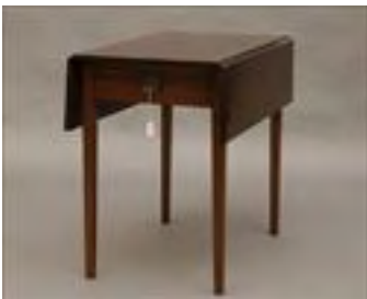
Lot #444: Pembroke Table