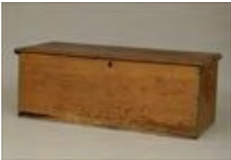
Lot #482: Blanket Chest