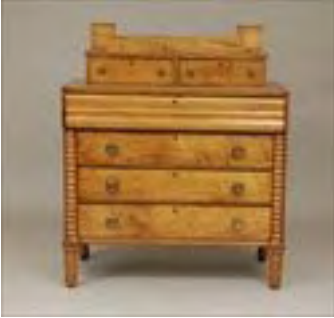
Lot #471: Late Federal Bird's Eye Maple Chest of Drawers