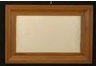
Lot #474: American Cherry Mirror