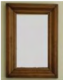
Lot #467: Cherry Pier Mirror Estimate: $ 50.00 - $ 100.00