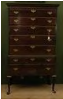
Lot #496: New England Highboy, married Estimate: $ 1500.00 - $ 3000.00