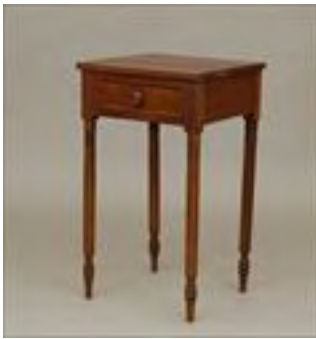
Lot #494: New England Cherry Night Stand Estimate: $ 150.00 - $ 250.00