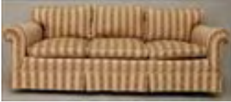
Lot #411: Upholstered Sofa Estimate: $ 100.00 - $ 200.00