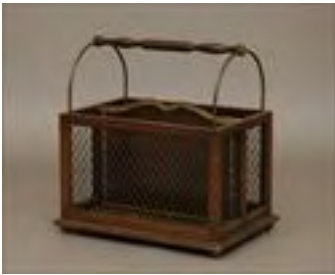
Lot #402: Mahogany and Brass Canterbury