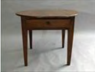
Lot #401: Oval-Top Single-Drawer Table