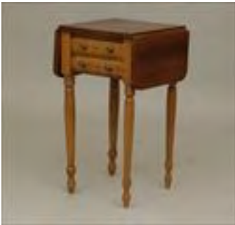
Lot #495: New England Bird's Eye Maple and Cherry Drop-Leaf Night Stand Estimate: $ 400.00 - $ 600.00