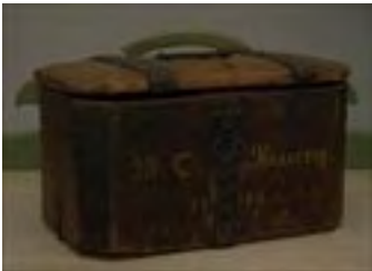
Lot #484: Continental Painted Wood and Iron Box