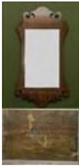
Lot #492: Philadelphia Federal Walnut Line Inlaid Mirror, Bearing Makers Label