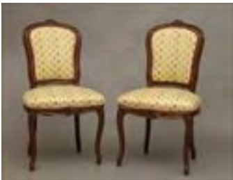
Lot #422: Pair of Louis XV-Style Side Chairs