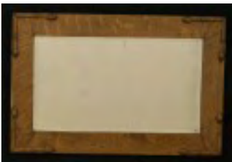
Lot #442: Oak Mirror