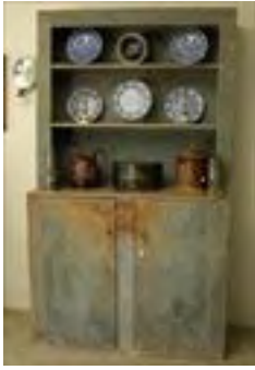
Lot #464: Blue-Painted Step-Back Cabinet Estimate: $ 300.00 - $ 500.00