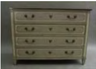
Lot #423: Directoire-Style Painted Chest of Drawers