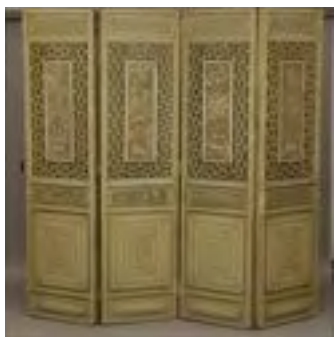
Lot #424: Four-Panel Chinese Screen