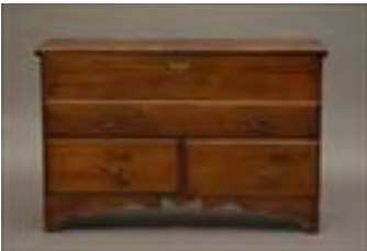
Lot #473: American Blanket Chest