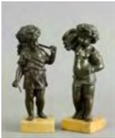
Lot #312: Two French Patinated Bronze Figures, "Summer" and "Fall"