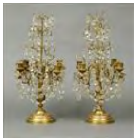
Lot #315: Pair of Louis XVI-Style Gilt-Metal and Cut Glass Four-Light Candelabra