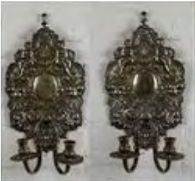
Lot #313: Pair of Charles II-Style Silverplate Two-Light Wall Sconces