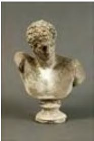
Lot #379: Cast-Concrete Bust of Hermes, After Praxiteles 33 1/2 in. Estimate: $ 300.00 - $ 500.00