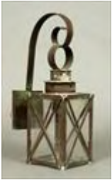
Lot #368: Colonial-Style Tin Hanging Lantern 17 1/4 x 5 3/4 x 8 1/2 in. Estimate: $ 100.00 - $ 200.00