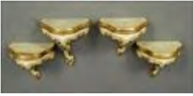
Lot #311: Set of Four Italian Rococo-Style Painted and Parcel-Gilt Wall Brackets, Modern