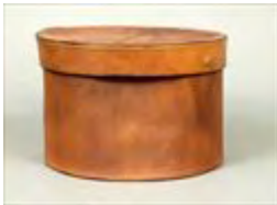
Lot #369: Leather Hat Box, Modern 7 1/2 in., 10 7/8 in. diam. Estimate: $ 50.00 - $ 75.00