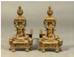
Lot #370: Pair of Louis XVI-Style Gilt-Brass Andirons 13 3/8 x 7 1/8 x 15 1/4 in. Estimate: $ 150.00 - $ 250.00