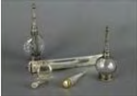
Lot #378: Near Eastern Silverplate Pen and Ink Holder, Two Silvered-Metal Mounted Glass Rose Water Dispensers and Two Silver-Mounted Glass Bottles 2 to 8 3/4 in. x 2 3/4 to 11 1/2 in. Estimate: $ 200.00 - $ 400.00