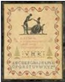
Lot #380: Needlework Sampler Framed; 14 1/2 x 11 1/4 in. (sight). Estimate: $ 30.00 - $ 50.00