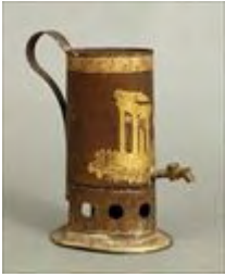
Lot #367: French Tôle-Peinte Pot with Spigot 7 3/4 in. Estimate: $ 150.00 - $ 250.00