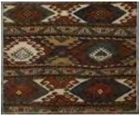
Lot #377: Framed Fragment of Kilim Rug 14 1/4 x 17 1/4 in. (frame). Estimate: $ 50.00 - $ 75.00