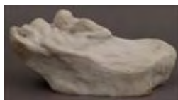
Lot #392: CHESTER BEACH (1881-1956): FIRST BORN Marble, 10 x 21 x 9 in. Estimate: $ 1000.00 - $ 1500.00