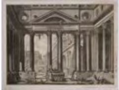
Plate 154 of the 2nd volume of Le Antichita Romane II; etching on paper, mounted on board, 14 5/8 x 20 1/16 in. (image). Provenance: The Lunquist family. Estimate: $ 200.00 - $ 400.00