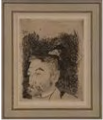
Lot #332: AFTER PAUL GAUGIN: PORTRAIT OF STEPHAN MALLARMÉ Etching on paper, 7 3/16 x 5 11/16 in. (image, sight), initialed in plate. Estimate: $ 100.00 - $ 200.00