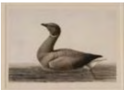
Lot #336: SAMUEL NORTHCOTE JR: GRAY DUCK Watercolor on paper, 5 3/8 x 7 11/16 in. (sight), signed and dated March 1787 lower left. Estimate: $ 200.00 - $ 400.00