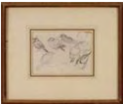
Lot #335: BRITISH SCHOOL: BIRD STUDY Graphite on paper (watercolor highlighting to one bird), 5 x 7 in. (sight). Estimate: $ 300.00 - $ 500.00