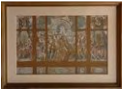
Lot #333: EVERETT SHINN (1876 - 1953): PARTY SCENE Gouache on paper, 18 x 28 in. (sight), signed middle center. Estimate: $ 3000.00 - $ 5000.00