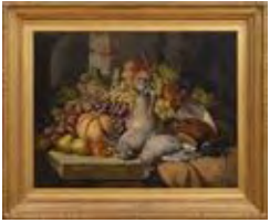
Lot #468: CONTINENTAL SCHOOL: STILL LIFE WITH PHEASANTS, FRUIT AND JUG Oil on canvas, 28 x 36 in., unsigned. Estimate: $ 1000.00 - $ 2000.00