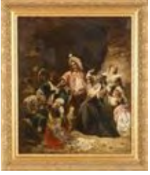
Lot #467: CONTINENTAL SCHOOL: "THE BOUNTY" Oil on canvas, 25 1/2 x 21 1/4 in., signed Voillemdt lower right. Estimate: $ 1000.00 - $ 2000.00