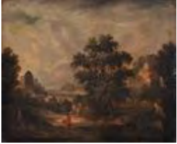
Lot #262: EUROPEAN SCHOOL: TRAVELERS IN A LANDSCAPE

Oil on canvas, 20 x 24 in., attributed on stretcher to Richard Wilson