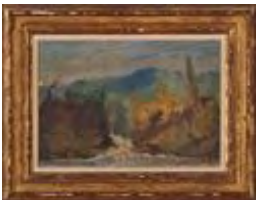
Lot #266: LOUIS EILSHEMIUS (1864-1941): LANDSCAPE WITH DEER

Oil on panel, 10 5/8 x 14 5/8 in., dated 1919.