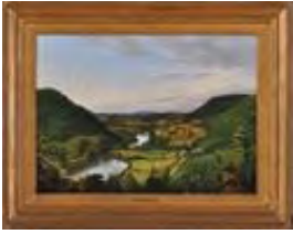
Lot #247: MANNER OF JON WILLIAMSON: LANDSCAPE WITH RIVERS AND A FARM Oil on canvas, 17 x 23 in., initialed lower left and titled in black paint on verso. Estimate: $ 1200.00 - $ 1800.00