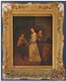
Lot #223: EUROPEAN SCHOOL: LADY BEING DRESSED Oil on panel, 12 x 9 1/2 in. Provenance: The Berkshire Museum, Pittsfield, MA. Estimate: $ 800.00 - $ 1200.00