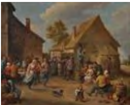
Lot #250: MANNER OF DAVID TENIERS: VILLAGE CELEBRATION Oil on canvas, laid down on panel; 25 x 31 1/22 in., bearing signature. Estimate: $ 1500.00 - $ 2500.00