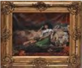
Lot #224: CONTINENTAL SCHOOL: HAREM MAID WITH PEACOCK FAN Oil on canvas, 20 x 26 3/4 in. Estimate: $ 3000.00 - $ 5000.00