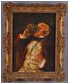
Lot #225: A.L. GRACE (19TH/20TH): SLAKING HIS THIRST Oil on canvas, 16 x 12 in., signed. Estimate: $ 600.00 - $ 800.00