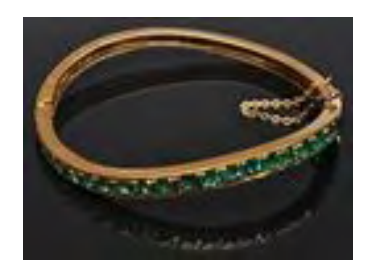
Lot #507: GOLD AND EMERALD BANGLE BRACELET