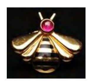
Lot #513: CARTIER GOLD AND ENAMEL BEE PIN

Stamped 18k, approx. 8 1/2 in. Estimate: $ 1200.00 - $ 1800.00