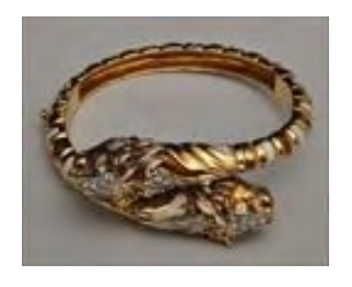
Lot #521: TIGER BRACELET Stamped, approx. 2 1/2 x 2 1/2 in. Estimate: $ 1000.00 - $ 1500.00