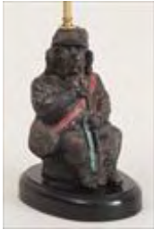
Figure 10 in., overall 25 in. Provenance: Sotheby's, New York.