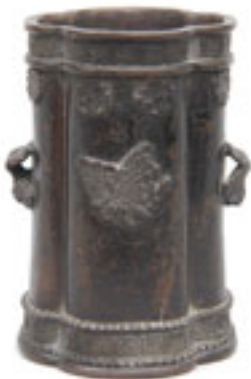
Lot #391: JAPANESE BRONZE BRUSH HOLDER 4 3/4 x 3 in. Estimate: $ 100.00 - $ 200.00