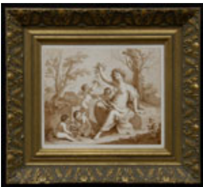
Lot #351: FLORA AND PUTTI Porcelain plaque with sepia decoration, 10 1/2 x 12 3/8 in. (sight), inscribed lower right, from Guercino, & signed W.P. Rhodes & initialed W.R. Estimate: $ 150.00 - $ 250.00