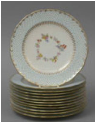
Lot #349: 12 MINTON CHINA DESSERT PLATES 9 1/4 in. diam. Estimate: $ 300.00 - $ 500.00