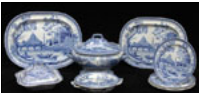
Lot #350: GROUP OF SPODE TRANSFER PRINTED DINNERWARE Each with view of St. Peter's in Rome & the Castle St. Angelo; together with Copeland & Garrett cup & saucer & four Copeland miniatures (not all items pictured). Estimate: $ 800.00 - $1200.00