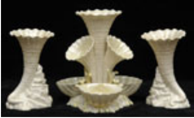
Lot #348: BELLEEK BLACK MARK CENTERPIECE Together with a pair of vases; heights: 6 7/8 & 5 3/4 in. Estimate: $ 300.00 - $ 500.00