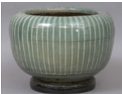
Lot #392: KOREAN CELADON-GLAZED POTTERY HIBACHI Of spherical form with vertical stripes, the everted rim pierced with two holes; 18 in. diameter. Estimate: $ 150.00 - $ 250.00