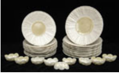
Lot #347: TWELVE BELLEEK BLACK MARK LUNCH PLATES Together with 12 dessert plates (9 1/4 & 8 in. diam.) and 9 3 1/4 in. nut dishes. Estimate: $ 300.00 - $ 500.00