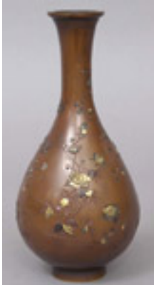
Lot #390: JAPANESE INCISED AND MIXED METAL INLAID COPPER VASE Pear-form, with gilt-metal leaves & silver flowers, signed; 8 1/2 in. tall. Estimate: $ 200.00 - $ 400.00