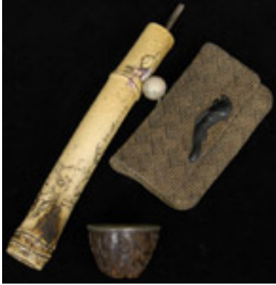
Lot #389: JAPANESE CARVED HORN PIPE SET With attached purse & a cup; 8, 7 3/4 & 4 3/4 in. long. Estimate: $ 75.00 - $ 125.00