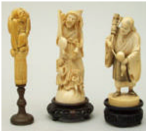
Lot #167: TWO JAPANESE CARVED FIGURES OF A MAN WITH BROOM & GOURD & A CHILD CARRYING A SACK ON BRASS BASE & A GOAN CARVED GROUP OF A MUSICIAN & TWO CHILDREN. Heights: 4 1/2 in., 5 1/4 in., 5 7/8 in. Estimate: $400 - $600