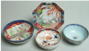
Lot #163: TWO JAPANESE IMARI BOWLS, ON OCTAGONAL PLATE & A CHINESE IMARI BOWL The bowls variously decorated in iron red & blue & green with cranes, song bird & flowers, an octagonal plate with bird in flight, lake view & mountain. Diameters: 5 7/8 in., 5 3/4 in., & 7 1/4 in. Width of plate: 7 3/4 in. Estimate: $100 - $150