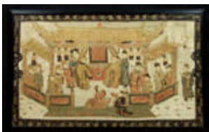
Lot #169: CHINESE SILKWORK PICTURE WITH GOLD THREAD Showing a bird in a garden pavilion receiving visitors & with attendants; ebonized wood frame. 29 1/2 in. x 47 1/2 in. From St. Mary's Convent, Peekskill, N.Y. Estimate: $200 - $300