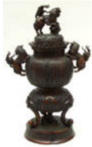
Lot #165: JAPANESE BRONZE ARCHAISITIC COVERED CENSER ON ATTACHED TRIPOD STAND With calligraphic panels, shi shi handles & cover, tiao tieh legs; 24 in. tall. Estimate: $500 - $700