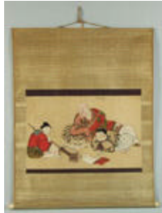
Lot #166: JAPANESE SCROLL PAINTING Watercolor on paper, approx. 43 3/4 in. x 34 1/2 in., showing a reclining scholar resting on a tiger skin, and 2 attendants; ivory tipped roller. Estimate: $300 - $500