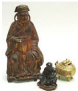
Lot #168: TWO BRONZE SEATED FIGURES & A BRASS CENSER The larger a nobleman with traces of gilding, the smaller a bearded scholar with left elbow resting on a stool, fitted wood stand; the censer with growling Fu dog cover; heights: 13 1/4 in. & 4 in. Estimate: $500 - $700