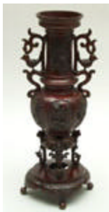
Lot #164: JAPANESE BRONZE ARCHAISTIC VASE ON STAND With bird & foliate panels in relief, vine & bird handles, tripod legs & attached stand; 16 in. tall. Estimate: $250 - $350