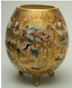
Lot #162: JAPANESE SIGNED WHITE EARTHENWARE (SATSUMA) TRIPOD VASE The ovoid bowl with shaped figural panels beneath a lappet border, gilt overlay feet; 5 3/4 in. tall. Estimate: $200 - $300