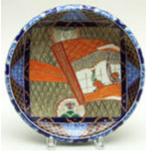
Lot #161: JAPANESE IMARI SHALLOW BOWL With inverted rim & decorated with overlaid "Obi" panels. 12 in. diameter. Estimate: $200 - $300