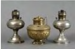
Figure 4 1/4 x 6 1/4 in. Estimate: $ 100.00 - $ 200.00