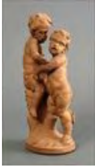
Lot #421: French Terracotta Figure Group with Two Putti