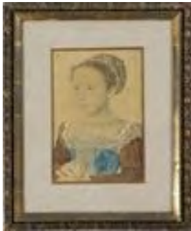
Lot #422: European School: Portrait of a Woman in Elizabethan Costume

Color print, matted and framed; 10 3/4 x 7 1/4 in. (sight).