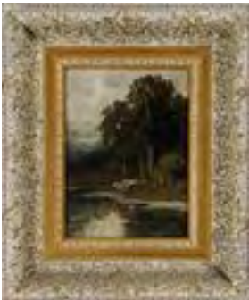
Lot #423: European School: Landscape with Cows

Oil on canvas, signed lower left, framed; 12 x 9 in.