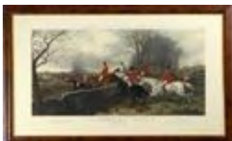
Lot #424: English School: Four Sporting Scenes

Hand-colored aquatints, framed; 28 1/2 x 49 1/2 in. (sight).