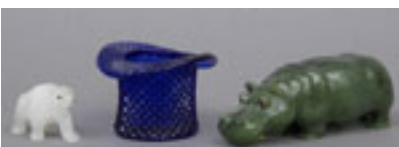
Lot #327A: CARVED JADE HIPPOPOTAMUS Together with an alabaster polar bear and a glass top hat toothpick holder. Heights: 1 5/8 to 2 5/8 in.