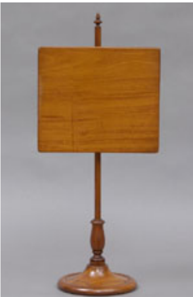
Lot #327: VICTORIAN SATINWOOD TABLE SCREEN The rectangular adjustable screen on spindle & turned foot. 21 in. tall.