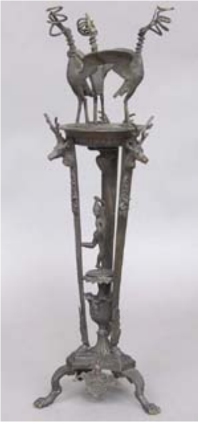
Lot #326: ROMAN-STYLE TRIPOD METAL STAND 25 1/2 in. tall.