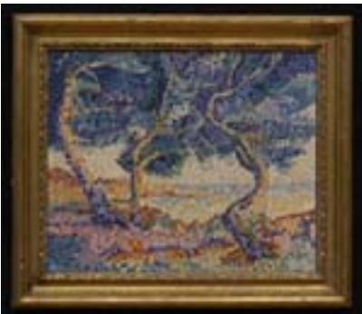
Lot #433: POINTILLIST LANDSCAPE, 20TH C.

Oil on canvas, 20 x 23 5/8 in., unsigned.