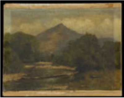
Lot #431: AMERICAN SCHOOL MOUNTAIN STREAM Oil on canvas laid down on paperboard, 9 3/4 x 14 in., unsigned.