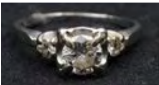
Lot #148: White-Gold Ring W. Rice Co., marked 14k. Estimate: $ 400.00 - $ 800.00