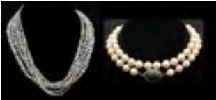
Lot #146: Two Necklaces Estimate: $ 75.00 - $ 125.00