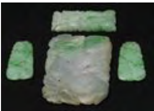
Lot #149: Four Chinese Carved Jade Pendants 1 3/8 to 2 1/4 in. Estimate: $ 40.00 - $ 60.00