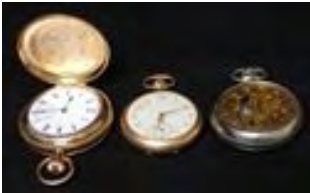
Lot #147: Three American Pocket Watches Estimate: $ 500.00 - $ 700.00