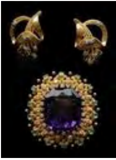
Lot #145: Brooch with Faceted Stones Together with a pair of ear clips stamped 750. Provenance: Collection of a French Gentleman. Estimate: $ 400.00 - $ 600.00