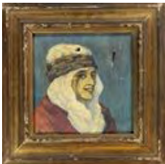
Lot #294: Continental School: Arabian Figure Oil on canvas, signed Le Provost lower right, framed; 12 x 12 in. (sight). Estimate: $ 100.00 - $ 200.00