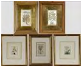
Lot #225: Five Botanical Prints Hand-colored engravings and hand-colored woodblock prints, framed; 3 to 5 in. x 2 1/2 to 2 3/4 in. (sight). Estimate: $ 300.00 - $ 500.00