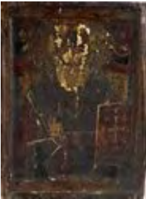
Lot #223: Continental School: Icon Tempera and gesso on board; 10 3/4 x 8 in. Provenance: Property from the Collection of Patti Cadby Birch. Estimate: $ 75.00 - $ 125.00