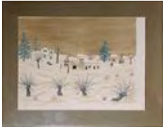
Lot #291: M. Lorand: Winter Landscape with Cottages Serigraph in colors, signed in plate lower right, matted. Together with assorted hand-colored engravings; serigraph 17 x 23 1/4 in. (sight). Estimate: $ 200.00 - $ 300.00