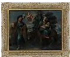
Lot #296: Continental School: Mary, Joseph and the Infant Jesus Oil on canvas, framed; 10 1/4 x 13 1/2 in. (sight). Estimate: $ 200.00 - $ 400.00