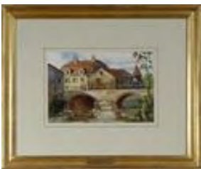
Lot #224: Paul Strisik (20th C.): "Village Bridge - Chablis, France" Watercolor on paper, signer lower left, gallery label on verso, matted and framed; 6 x 9 in. Estimate: $ 200.00 - $ 400.00