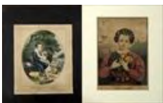
Lot #295: Currier and Ives (1834-1907): "Brother and Sister" and "Little William" Hand-colored lithographs, one matted; 12 x 10 in. (sheet) and 12 1/2 x 8 3/4 in. (sight) Estimate: $ 100.00 - $ 200.00