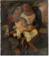
Lot #251: Continental School (19th C.): Virgin Mary with Infants Jesus and St. John the Baptist

Oil on canvas, unframed; 30 3/4 x 26 1/2 in.