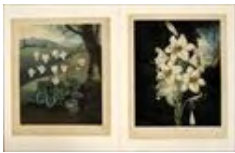
Lot #254: English School (19th C.): "The Persian Cyclamen" and "The White Lily"

Aquatints, matted; 16 1/4 x 19 1/2 in. and 21 x 16 in. (sight).