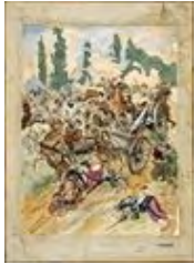
Lot #292: L. Soucek: Battle Scene Watercolor on paper laid down on paperboard, signed lower right, unframed. Together with two prints; watercolor 19 1/2 x 15 in. Estimate: $ 30.00 - $ 50.00