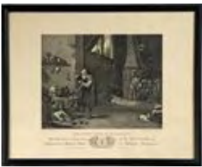
Lot #222: After David Teniers, Jr.: "The Mystic Book of Hypocrates" Reproduction of an engraving by Francois Basan, framed; 15 3/4 x 19 1/2 in. (sight). Estimate: $ 40.00 - $ 60.00