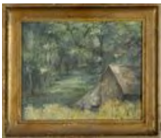
Lot #256: Muriel Smarschke (20th C.): Landscape with Cottage

Oil on artists board, signed lower right, framed; 12 x 14 1/2 in. (sight).