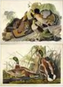
Lot #221: After John James Audubon: Twenty-Six Reproduction Prints 25 1/4 to 26 1/2 x 38 to 38 1/2 in. Estimate: $ 200.00 - $ 400.00