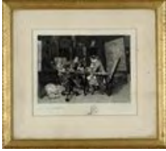
Lot #252: Armond Matley: Interior Scene with Two Gentlemen Playing Chess

Engraving, signed in pencil lower left, matted and framed; 12 x 14 1/2 in. (sight).