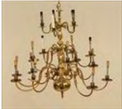
Figure 19 1/4 (26 1/2 in. overall). Estimate: $ 200.00 - $ 400.00