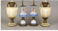
Lot #711: Pair of Continental Gilt-Metal Mounted Enameled Opaque White Glass Vases, Mounted as Lamps Together with a pair of porcelain urns, mounted as lamps; 27 1/4 to 28 1/4 in. overall. Estimate: $ 80.00 - $ 120.00