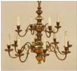
Lot #712: 17th Century-Style Brass Twelve-Light Chandelier 30 in., 31 in. diam. Estimate: $ 700.00 - $ 900.00