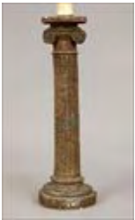
Lot #713: Patinated Plaster Ionic Column-Form Table Lamp 38 in. overall. Estimate: $ 50.00 - $ 100.00