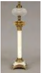
Lot #714: Victorian Gilt-Metal Mounted Alabaster and Cut Glass Banquet Lamp Converted into table lamp; 41 in. overall. Estimate: $ 100.00 - $ 200.00