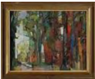
Lot #221A: ANTHONY TONEY (b. 1913): "CARRIAGE HOUSE" Oil on canvas, 22 x 28 in., signed, titled and dated 1956. Estimate: $ 500.00- $ 700.00