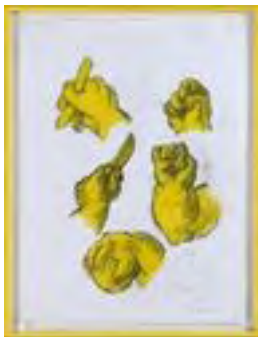
Lot #223: TOM OTTERNESS (b. 1952): HAND STUDIES Yellow pastel and pencil drawing, 24 1/2 x 19 in., signed in pencil on verso and dated '83. Estimate: $ 400.00 - $ 600.00