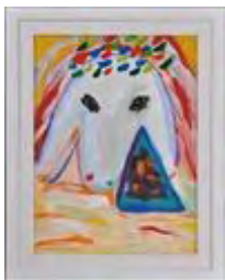
Lot #379: MENASHE KADISHMAN (b. 1932): PORTRAIT OF A SHEEP Acrylic on canvas, 32 x 24 in., signed. Estimate: $ 1200.00 - $ 1800.00