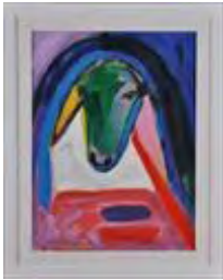
Lot #377: MENASHE KADISHMAN (b. 1932): PORTRAIT OF A SHEEP Acrylic on canvas, 32 x 24 in., signed. Estimate: $ 1200.00 - $ 1800.00