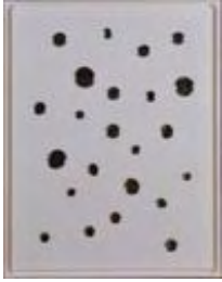
Lot #431: KARIN DAVIE (b. 1965): "LIAR VII" Mirrored glass on paper construction, 49 x 38 in., signed and dated '99, Mary Boone Gallery exhibition label on verso. Estimate: $ 200.00 - $ 400.00