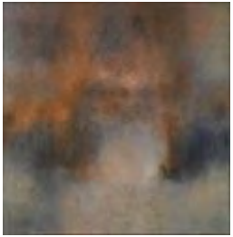
Lot #434: REBECCA PURDUM (b. 1959): UNTITLED Oil on canvas, 72 x 72 1/4 in.; signed, numbered TS387 and dated 3-94 on selvage. Estimate: $ 1000.00 - $ 2000.00