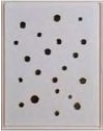
Lot #432: KARIN DAVIE (b. 1965): "LIAR XI" Mirrored glass on paper construction, 49 x 38 in., signed and dated '99, Mary Boone Gallery exhibition label on verso. Estimate: $ 200.00 - $ 400.00