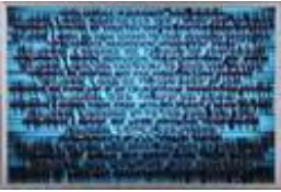
Lot #433: KIKI SEROR (b. 1970): "SALOME BITES WHAT HE-ROD EATS: A FICTIONAL REUNION" 2000 Digital durations in aluminum lightbox, 40 x 60 in., numbered 1/3, I-20 Gallery label on verso. Estimate: $ 300.00 - $ 500.00