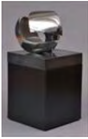
Lot #466: ROY GUSSOW (b. 1918): UNTITLED Steel sculpture, approx. 18 x 20 in. on black marble base, 5 x 24 x 24 in. Estimate: $ 300.00 - $ 600.00