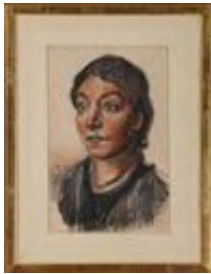
Lot #467: DAVID BURLIUK (1882-1967): PORTRAIT OF A WOMAN Pastel on paper, 14 x 9 in. (image), signed and dated 1930 at left side, Cold Springs Harbor Gallery label on verso. Estimate: $ 800.00 - $ 1200.00