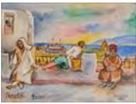
Lot #468: DAVID BURLIUK (1882-1967): "TANGIERS/MAROC" Watercolor and wash on paper, signed, titled and dated 1954 lower right; 10 1/2 x 14 1/4 in. (image). Provenance: Property from a Long Island Estate. Estimate: $ 1000.00 - $ 1500.00