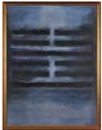
Lot #435: C.M. HAYES: UNTITLED Oil on canvas, 48 x 36 in., signed and dated '94 on verso. Estimate: $ 500.00 - $ 700.00