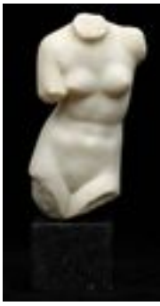
Lot #296: CARVED MARBLE TORSO OF VENUS, AFTER THE ANTIQUE On a speckled black marble base, overall height: 13 in. Estimate: $ 600.00 - $ 800.00