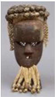
Lot #288: AFRICAN CARVED, PAINTED AND NAILED COPPER MOUNTED FACE MASK With grass hair and beard, 19 in. tall. Estimate: $ 150.00 - $ 250.00