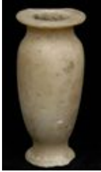
Lot #297: EGYPTIAN ALABASTER OVOID JAR 9 3/4 in. tall. Estimate: $ 100.00 - $ 200.00