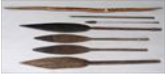
Lot #287: FOUR OCEANIC INCISED WOOD OARS Together with three other pieces, 4 ft. 7 in. to 7 ft. 1 in. tall. Estimate: $ 200.00 - $ 300.00