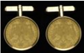
Lot #299: HUNGARIAN COIN CUFFLINKS Circa 1915, 22K gold coins mounted as cufflinks with 14K yellow gold wing backs, 12/1 dwt; 1 3/16 in. diam. Estimate: $ 300.00 - $ 400.00