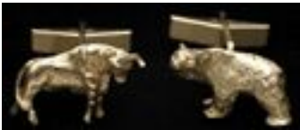
Lot #300: 14K BULL AND BEAR CUFFLINKS Pair of 14K yellow gold bull and bear cufflinks with wingbacks; 14 dwt. Estimate: $ 250.00 - $ 350.00