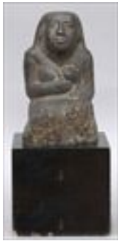
Lot #298: EGYPTIAN CARVED STONE BLOCK FIGURE OF A SEATED WOMAN On ebonized base; 10 1/8 in. x 7 in. x 8 1/2 in. Estimate: $ 600.00 - $ 800.00