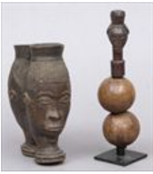
Lot #286: LUBA JANUS-HEAD RATTLE AND A DOUBLE VASE 9 1/8 in. and 7 in. tall. Estimate: $ 150.00 - $ 250.00