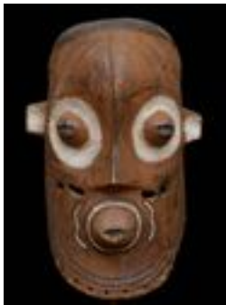
Lot #290: AFRICAN CARVED AND PAINTED HEAD MASK 16 in. tall Estimate: $ 200.00 - $ 300.00