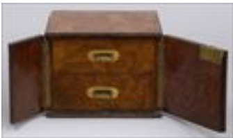
Lot #375: VICTORIAN INLAID BURL WALNUT BOX 9 1/4 in. x 11 3/4 in. x 9 1/4 in. Estimate: $ 200.00 - $ 400.00