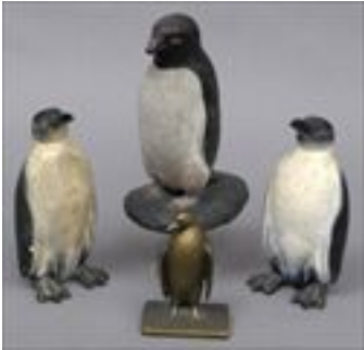
Lot #374: FOUR PENGUIN FIGURES The tallest 9 3/4 in. Estimate: $ 100.00 - $ 200.00