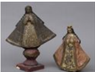
Lot #377: TWO SPANISH COLONIAL CARVED, PAINTED AND PARCEL-GILT FIGURES OF THE VIRGIN MARY 12 1/2 in. and 14 1/2 in. tall. Estimate: $ 200.00 - $ 300.00