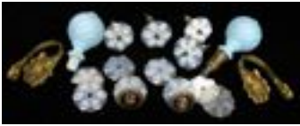
Lot #373: GROUP OF CURTAIN TIE-BACKS AND TWO FINIALS Estimate: $ 200.00 - $ 400.00