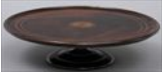
Lot #371: GEORGE III-STYLE INLAID MAHOGANY LAZY SUSAN The rotating tray top with stringing and fan rondel, 5 1/4 in. tall. Estimate: $ 125.00 - $ 175.00