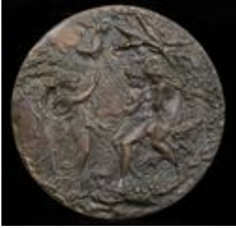
Lot #372: REPOUSSE' COPPER RONDEL: ADAM & EVE AND THE ANGEL Together with a carved shell. 9 3/4 in. and 6 1/2 in. diam. Estimate: $ 250.00 - $ 450.00