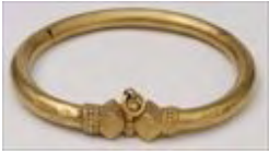
Lot #97: LARGE GOLD PERSIAN-STYLE BRACELET Provenance: Property from the Collection of Patti Cadby Birch. Estimate: $ 200.00 - $ 400.00