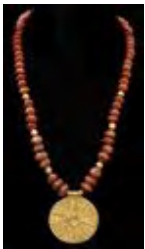
Lot #99: PERSIAN-STYLE STONE, BEAD AND PENDANT NECKLACE 18 in. Provenance: Property from the Collection of Patti Cadby Birch. Estimate: $ 200.00 - $ 400.00