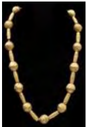
Lot #100: PERSIAN-STYLE BEADED NECKLACE 20 in. Provenance: Property from the Collection of Patti Cadby Birch. Estimate: $ 150.00 - $ 250.00