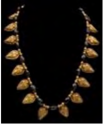
Lot #98: PERSIAN-STYLE FIGURAL PENDANT AND STONE BEAD NECKLACE 17 in. Provenance: Property from the Collection of Patti Cadby Birch. Estimate: $ 300.00 - $ 500.00