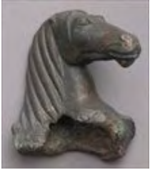
Lot #202: HELLENISTIC BRONZE HEAD OF A HORSE With incised mane, eyes and mouth; 2 1/2 x 2 1/8 in. Estimate: $ 1000.00 - $ 2000.00