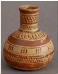
Lot #204: CORINTHIAN BUFF-GROUND BOTTLE VASE Decorated with terracotta bands and fluting at the shoulder; 3 1/4 in. Estimate: $ 400.00 - $ 600.00