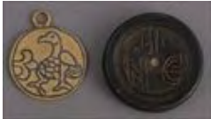
Lot #203: TWO BYZANTINE ARTICLES Comprising a gold pendant with cross and bird niello rondels and a bronze coin weight engraved with a cross above N.E. Estimate: $ 400.00 - $ 800.00