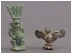
Lot #205: EGYPTIAN TURQUOISE-GLAZED FAIENCE FIGURE OF BES AND A GREEK HELLENISTIC SILVER SIREN The first modeled standing with feathered headdress, the other facing forward with female head, wings and talons; 1 and 2 in. Estimate: $ 1800.00 - $ 3200.00