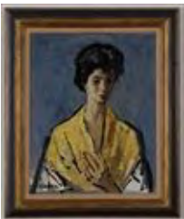
Lot #286: MOSES SOYER (1899-1974): GIRL IN YELLOW SHAWL Oil on canvas, 21 x 17 in., signed lower left. Estimate: $ 1500.00 - $ 3000.00