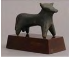
Lot #201: GREEK BRONZE FIGURE OF A BULL Modeled standing foursquare, on wood stand; 2 1/2 x 3 3/4 in. Estimate: $ 2000.00 - $ 4000.00