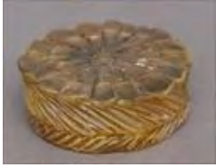
Lot #598: LINE VAUTRIN (1913-1997): PILLBOX Talosel and resin, circa 1965, 1 3/4 in. diam., 5/8 in. tall. Estimate: $ 600.00 - $ 800.00