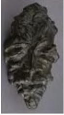
Lot #599: UNSIGNED: HEAD OF A BEARDED MAN Bronze wall mount; 6 1/4 x 3 1/8 in. Estimate: $ 50.00 - $ 75.00