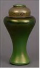
Lot #571: L.C. TIFFANY FAVRILLE MARK GLASS VASE The green iridescent bowl with incurved shoulder and dome top with 2 zig zag bands; 7 1/4 in. Estimate: $ 1000.00 - $ 1500.00