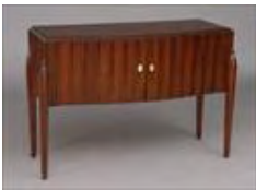
Lot #575: AMERICAN ART DECO ROSEWOOD SERPENTINE-FRONTED SIDEBOARD 34 x 47 x 20 in. Estimate: $ 1000.00 - $ 2000.00