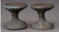
Lot #572: PAIR OF 20TH C. TEXTURED BRONZE "MUSHROOM" PEDESTALS Each with circular top and waisted stem; 10 x 10 in. diam. Estimate: $ 75.00 - $ 125.00