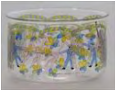
Lot #574: GUNNER CYREN (b. 1931): "SAILORS DREAM" Orrefors enameled bowl, signed Orrefors, Expo 682-68 Gunnar Cyren; 6 1/4 x 9 1/2 in. Estimate: $ 300.00 - $ 600.00