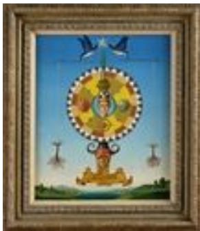
Lot #153: JEAN-PIERRE CLEMENT (b. 1943): "LA PLACE DES VOGES"

Oil on canvas, 18 x 25 1/2 in., signed, titled and dated '64.