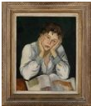
Lot #103: ISAAC SOYER (1907-1981): LOST IN THOUGHT