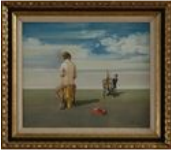
Lot #151: JEAN-PIERRE CLEMENT (b. 1943): "L'ETUDE"

Oil on canvas, 18 x 22 in., signed, titled and dated '63.