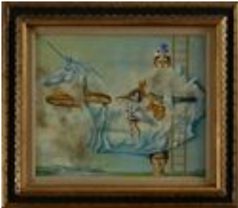
Lot #152: JEAN-PIERRE CLEMENT (b. 1943): "L'ENIGME"

Oil on canvas, 18 x 21 1/2 in., signed, titled and dated '65.