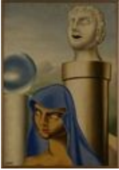
Lot #101: FÉLIX LABISSE (1905-1982): PASSAGE OF TIME

Oil on canvas, 26 x 18 1/4 in., signed lower left. Estimate: $ 2000.00 - $ 3000.00