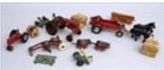
Lot #15: GROUP OF PAINTED CAST IRON FARM TOYS Comprising a McCormick Deering 2-horse drawn 14 1/2 in. wagon, a 7 1/2 in. tractor with 2 sit-on trailers, a 5 1/2 in. tractor, a 7 1/4 in. reaper and 2 manure spreaders, together with 8 wire-bound bales of hay and a 4 ox-drawn wood lumber cart. Estimate: $ 200.00 - $ 300.00