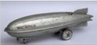
Lot #13: SILVERED METAL MODEL OF GRAF ZEPPELIN The ovoid hull with pierced cabin and metal wheels, with 2 decal logos and 6-pointed star rondel; 7 x 26 x 6 1/2 in. Estimate: $ 200.00 - $ 300.00