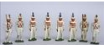
Lot #16: TWENTY-FOUR BARCLAY #143 PAINTED LEAD DIME STORE FIGURES OF MARCHING CADETS AND THIRTY-FIVE OTHER CADETS Estimate: $ 250.00 - $ 350.00