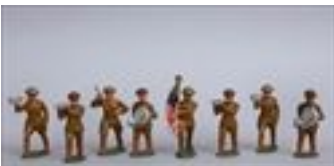
Lot #17: GROUP OF FIFTY BARCLAY PAINTED LEAD DIME STORE FIGURES OF ARMY MUSICIANS AND TWENTY OTHER MUSICIANS The Barclays with separate helmets, approx. 70 pieces. Estimate: $ 300.00 - $ 400.00