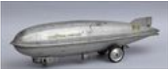
Lot #12: SILVERED METAL MODEL OF THE GOODYEAR ZEPPELIN The ovoid hull with pierced cabin metal forward wheel, rubber-thread lateral wheels and 3 propellers, with 2 decaled flag logos and 2 name logos; 8 x 31 x 7 1/4 in. Estimate: $ 250.00 - $ 350.00