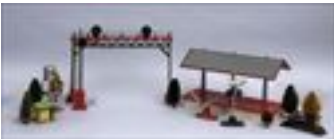
Lot #14: GROUP OF LIONEL MODEL TRAIN SET ACCESSORIES Comprising a signal bridge, station platform, water tower, 2 crossing lights and a barrier, together with an A.C. Gilbert Co. "American Flyer" control tower, a pontoon and a wood bridge and various trees; 3 1/4 to 14 3/4 x 3 1/4 to 20 in. Estimate: $ 150.00 - $ 250.00