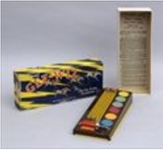
Lot #11: NO. 40 GEE-WIZ BOXED PAINTED METAL RACING GAME By the Wolverine Supply & Mfg. Co., Pittsburgh, PA, the sloping brown surface with 6 racers, with box; 2 1/2 x 15 x 5 1/2 in. Estimate: $ 80.00 - $ 120.00